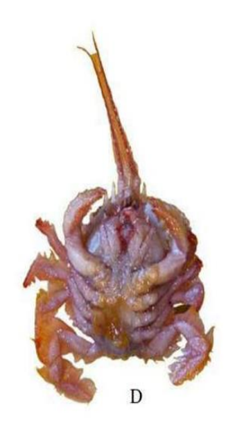
Plate 3. Dorsal and ventral view