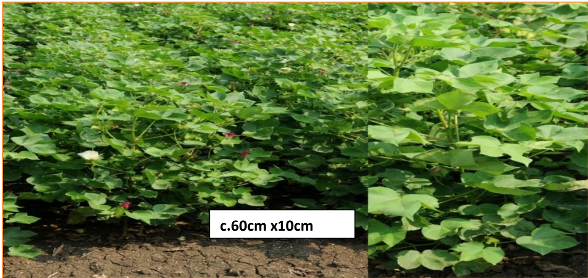
Plate 1. a,b,c - An Over view of crop in different crop geometry with growth pattern of individual plant at 60 DAS during the crop growth period 2018-19 at Lam, Guntur, AP during 2018-19