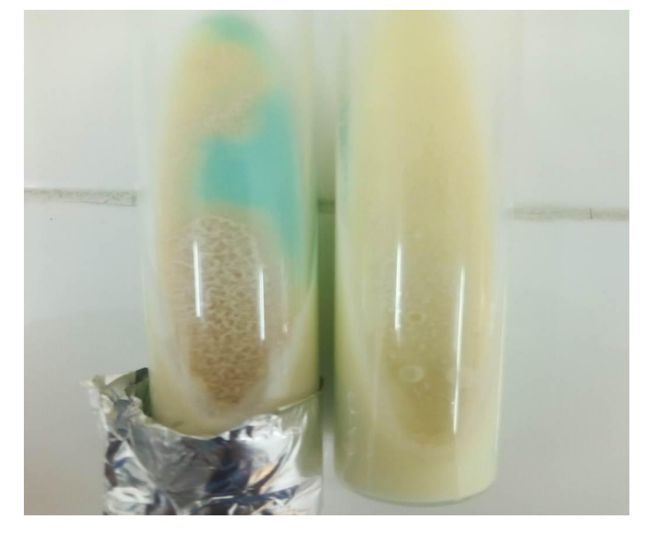
Fig. 2. Fast growing mycobacteria strains on loweinsten jensen; Colony with a rough, eugonic appearance, not pigmented in light (achromogenic strain)

Mycobacterioses differ depending on the species and hosts involved and on ways of infection, and may be present in pulmonary, skin or soft tissue lesions. There is a very little data on species distribution of these organisms in Cote d'Ivoire.