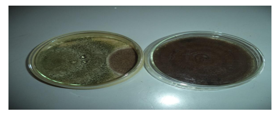
Fig. 2. Dual culture of T. harzianum and A. niger on potato dextrose agar inoculated same time (Th × path) (left) and pure culture of A. niger on Potato Dextrose Agar as control (right)

inhibition after 192 hours was higher (77.79%) than when T. harzianum was introduced same time with A. niger (45.96%) and the least percentage growth inhibition (28.47%) was recorded when T. harzianum was introduced two days after the inoculation of A. niger (Table 2). Mean variation of percentage growth inhibition of A. niger tested at three different times of introduction of T. harzianum significantly ( P \le 0.05 ) inhibited the growth of A. niger (Table 1).