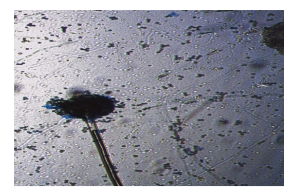
Fig. 1. Microscopic structure of A. niger (\times 10) with conidia borne by phialides on conidiophores (right)

Test fungus A. niger was isolated and identified as one of the fungi causing dry rot of white yam ( D. rotundata ) tubers in the study area. Macroscopic examination of pure cultures of this fungus on PDA showed dark brown colour. Microscopic examination and morphological characteristics and identification showed nonseptate conidiophores. Each conidiophores ends in a terminal enlarged spherical swellings. Conidia are borne by phialides arising from a terminal swelling on the conidiophores. It has 'mop-like' head of conidia (Fig. 1).