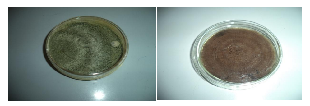
Fig. 4. Dual culture of T. harzianum and A. niger on potato dextrose agar (left); T. harzianum was introduced 2 days before inoculation of A. niger (2 dbi) and pure culture of A. niger on potato dextrose agar as control (right)