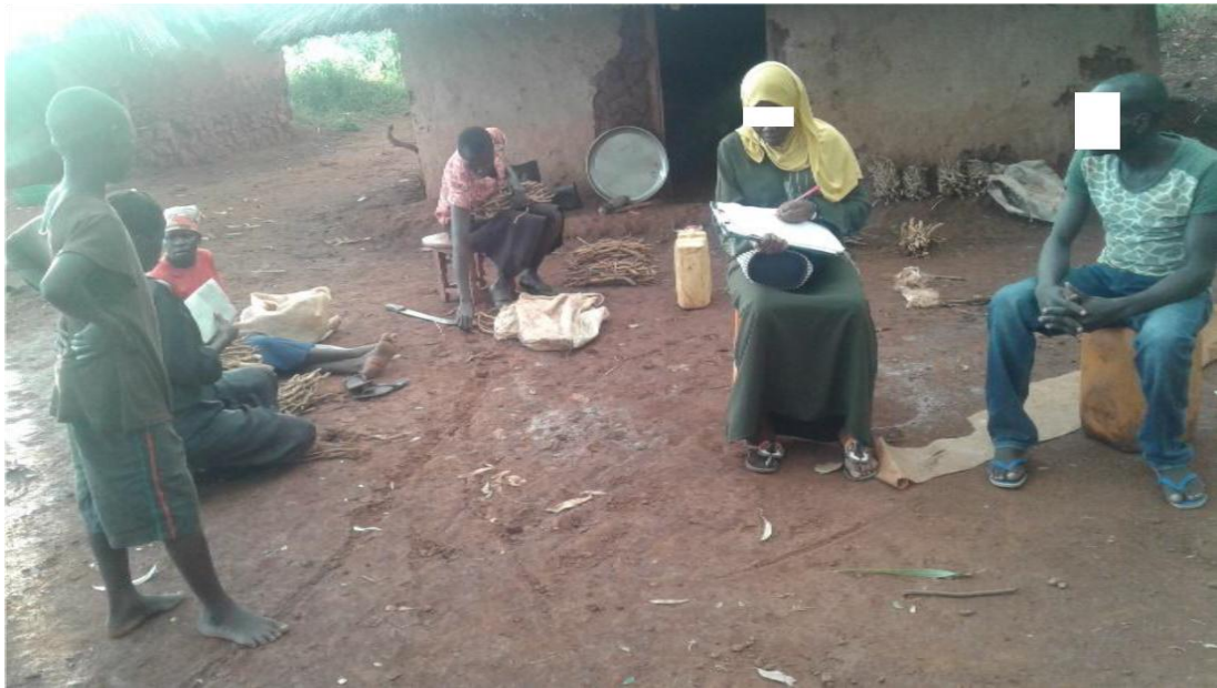
Fig. 1. Administration of questionnaires in Syanyonja village

amalgamation and losses due to adsorption onto pan walls are negligible. The procedure was repeated using different masses (2, 3, 4, 5 and 6 g) of mercury which are typical of the quantities of mercury used for amalgamation at different ASGM sites in Syanyonja village.