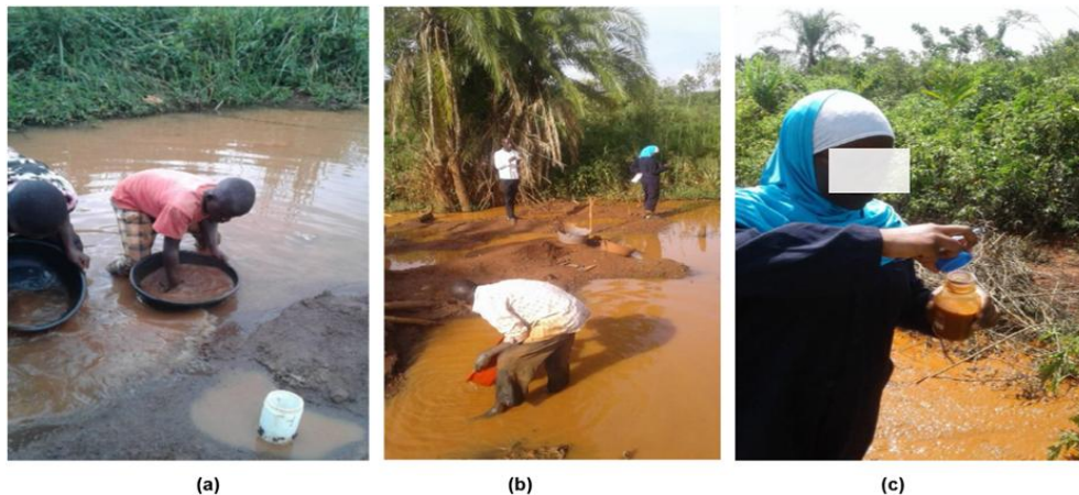
Fig. 2. Panning of alluvium along Namukombe stream : (a) by children (school dropouts). Notice the plastic tin used for storing recovered gold nuggets; (b) by a man. Notice the ditches created; (c) quality of water from the stream. Notice the destruction of shrubs in the right background (modified from [6], photos reproduced with permission)

for long hours in the scorching sun [6]. Gold artisans in Syanyonja employ rudimentary methods of gold extraction including panning [6], typical of other ASGM sites in Uganda [18,20, 21] (Fig. 2). Human health problems, diseases and neuropsychiatric disorders such as malaria, cholera, venereal diseases (HIV/AIDS, gonorrhoea, syphilis), musculoskeletal disorders (myalgia of the upper and lower limbs and the back), sleep disruption (insomnia), headache, anorexia, tremor of the fingers, loss of fecundity and abnormal fatigue have been reported in other ASGM communities [7,24-26].