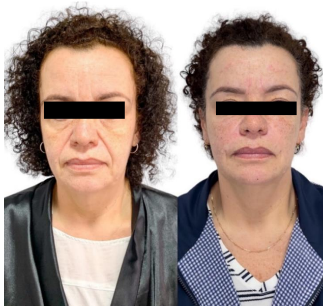
Fig. 2. Before and after treatment with minimally invasive procedures

It is observed that combined therapies provide facial volumetric replacement and improve sagging (Fig. 2.).