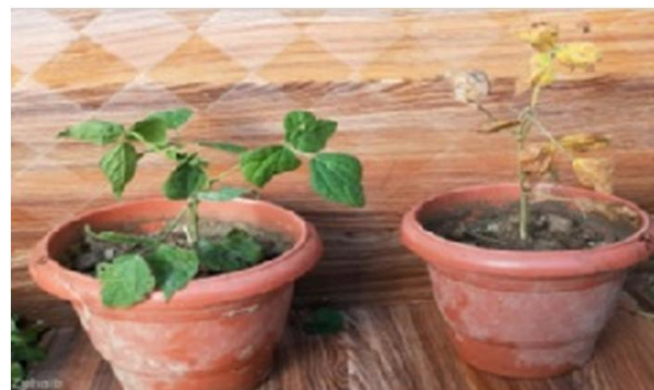
Un-inoculated Inoculated with Rhizoctonia solani