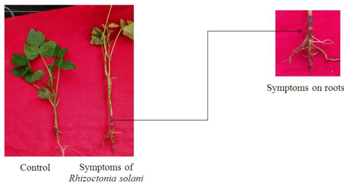
Control Symptoms of Rhizoctonia solani