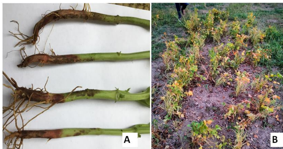
Fig. 1. Symptoms of root rot observed under field condition; A: Rotting symptoms developed on roots, B: Above ground plant symptoms due to root rot