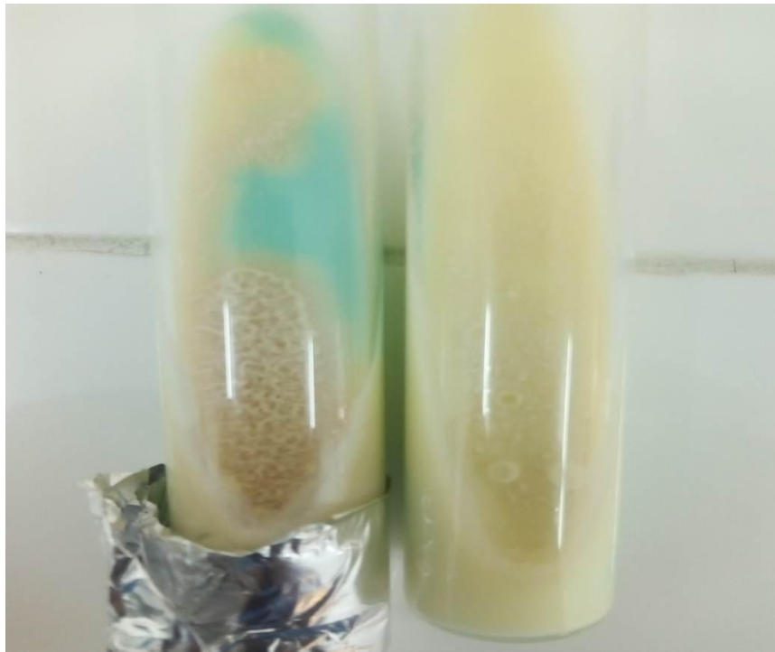
Fig. 2. Fast growing mycobacteria strains on loweinsten jensen (photo: Vakou S); Colony with a rough, eugonic appearance, not pigmented in light (achromogenic strain)

Mycobacterioses differ depending on the species and hosts involved and on ways of infection, and may be present in pulmonary, skin or soft tissue lesions. There is a very little data on species distribution of these organisms in Cote d'Ivoire.