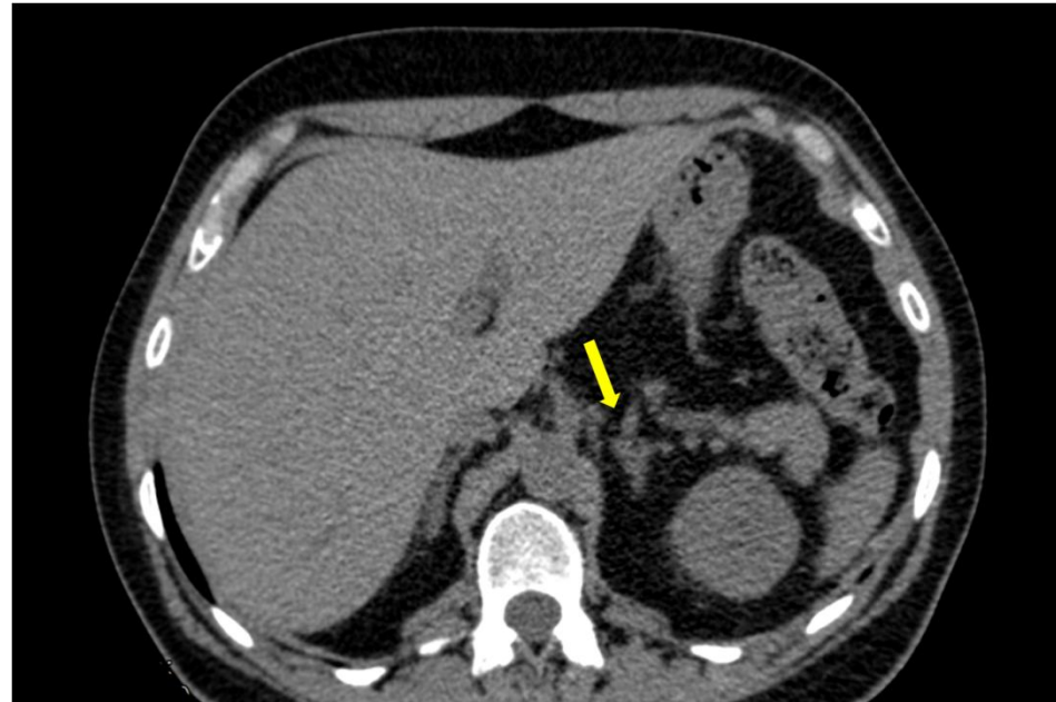
Fig. 2. Pre-surgical abdominal CT scan of the patient, showing an enlarged and irregular left adrenal not suggestive of adenoma

PRA: Plasma Renin Activity; A/PRA: Aldosterone / Plasma Renin Activity; n. a.: Not available